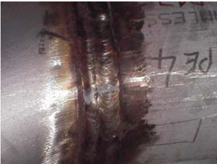
Welded stainless part in the "as welded" condition: the oxide scale is likely to give way to corrosion if not properly removed.

As heat tints are formed on the surface of stainless steel chromium is drawn to the surface of the steel, as chromium oxidises more readily than the iron in the steel. This leaves a layer at and just below the surface with a lower chromium level than in the bulk of the steel, and so a surface with reduced corrosion resistance.