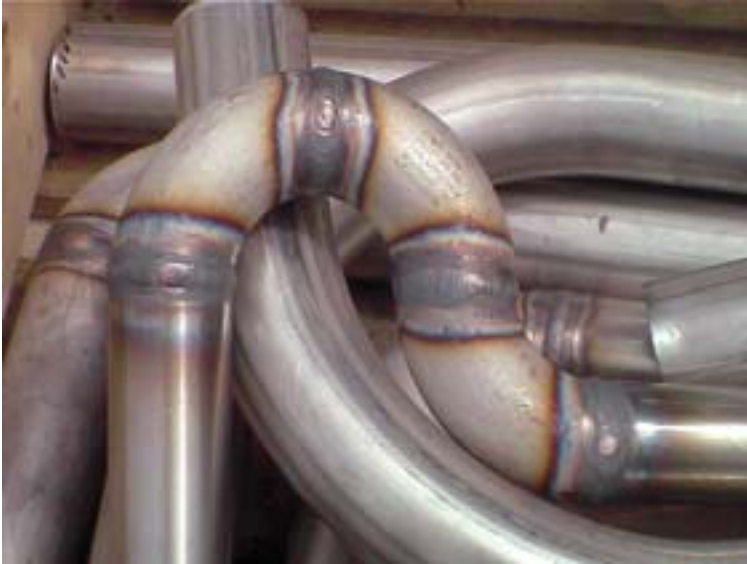
Light scaling left on weld caps and heat tint on the surrounding parent tube surfaces can usually be removed by acid pickling.