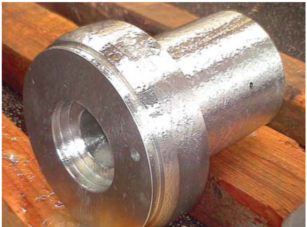
Small stainless steel parts can be effectively pickled with brush-on gel.

Your nearest national stainless steel development association should be able to advise on pickling product and pickling service suppliers locally available.