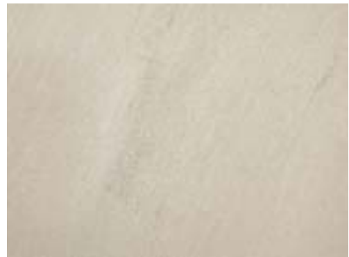
A matt grey is left on annealed mill products following descaling and pickling. Mechanical scale loosening roughens the surface.