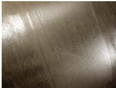
Stainless steel surfaces form a grey/black scale during hot rolling or forming. This tenacious oxide scale is removed in the steelmill by descaling.

Pickling is the removal of a thin layer of metal from the surface of the stainless steel. Mixtures of nitric and hydrofluoric acids are usually used for pickling stainless steels. Pickling is the process used to remove weld heat tinted layers from the surface of stainless steel fabrications, where the steel's surface chromium level has been reduced.