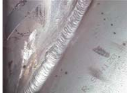
Detail of the welded area after chemical surface treatment: the purpose of this treatment is not to remove the weld seam itself, but the welding tint that accompanies it.

Heat tint is often seen in heat affected areas of welded stainless steel fabrications, even where good gas shielding practice has been used (other weld parameters such as welding speed can affect the degree of heat tint colour formed around the weld bead).