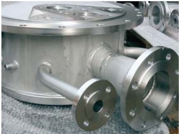
Heat tint left in welded areas of a complex fabrication can be effectively removed by pickling by immersion pickling. The corrosion resistance of the whole fabrication has been restored by pickling.