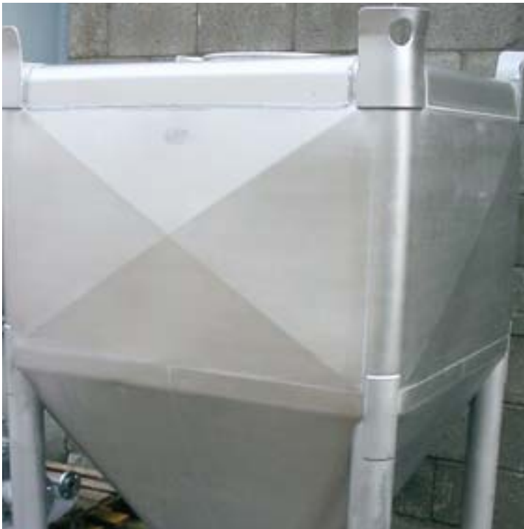
After cleaning, pickling and passivation treatments a sound and consistent finish is produced. This looks good and gives a surface with optimum corrosion resistance for the particular stainless steel grade used.

Your nearest national stainless steel development association should be able to advise on companies providing specialist assistance on developing surface finish standards for specific projects.