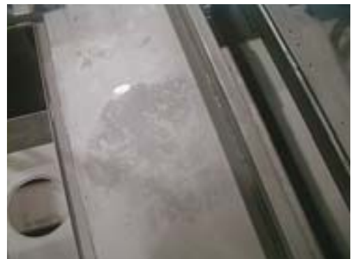
Patchy, uneven pickled surfaces can result if surfaces are not clean before the acid treatment.

If stainless parts are contaminated with grease or oil, then a cleaning operation prior to acid treatment should be carried out.